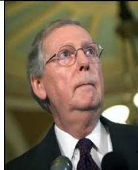
Minority Leader Mitch McConnell (R-KY)