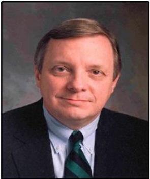
Majority Whip Sen. Dick Durbin (D-IL)