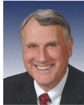
Republican Whip Sen. Jon Kyl (R-AZ)