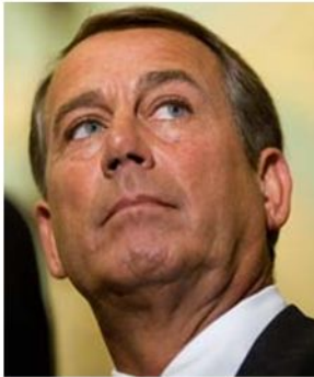
Speaker of the House John Boehner (R-OH)