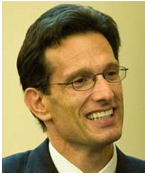
Majority Leader Eric Cantor (R-VA)