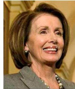
Nancy Pelosi* (D-CA)