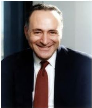
Vice Chairman of the Democratic Caucus Sen. Chuck Schumer (D-NY)