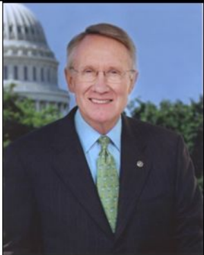
Senate Majority Leader Harry Reid (D-NV)