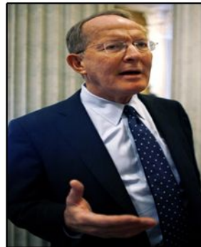
Republican Conference Chairman Sen. Lamar Alexander (R-TN)