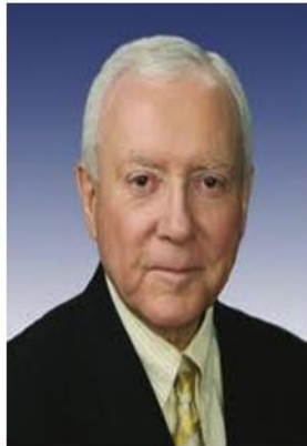
Senator Orrin Hatch (R-UT) Ranking Member, Finance