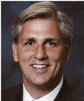
Majority Whip Kevin McCarthy (R-CA)