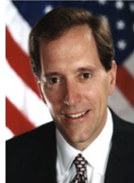
Rep. Dave Camp (R-MI) Chairman, Ways & Means