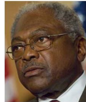
James Clyburn (D-SC)