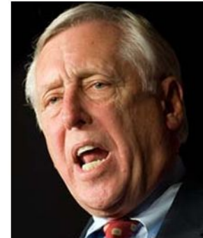
Steny Hoyer (D-MD)