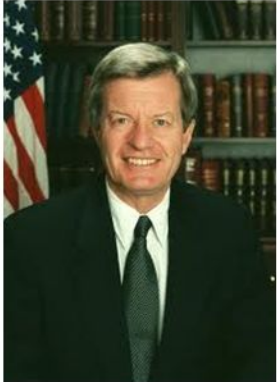
Senator Max Baucus (D-MT) Chairman, Finance